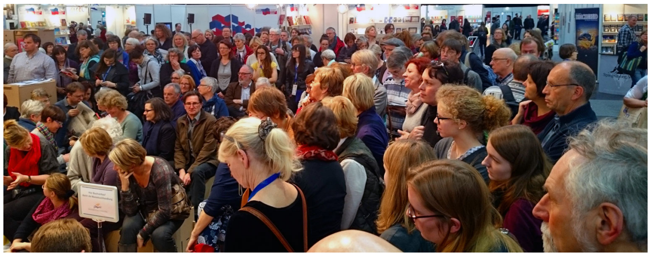
Audience at The Leipzig Book Fair 2015

NORLA aims to establish solid collaborative relationships within the framework of a main concept in 2016 and as soon as possible establish specific, individual projects to take place before, during and after the book fair in 2019, in Frankfurt, other German cities and Norway.