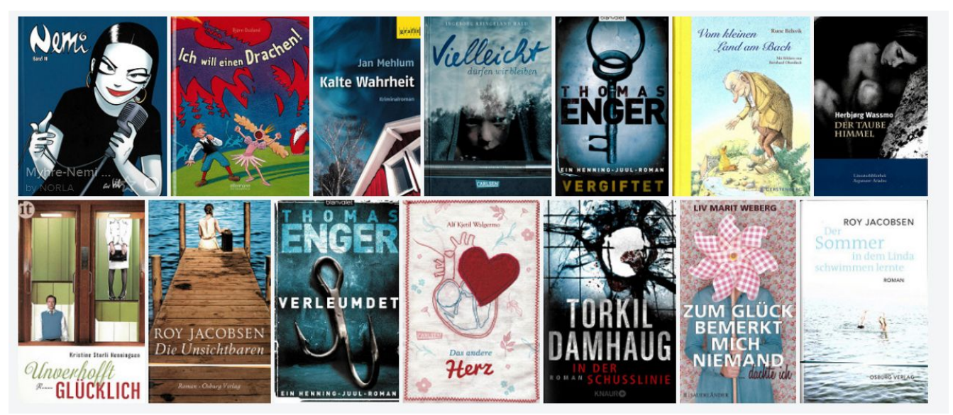
Norwegian books in German translation

the foundation is laid to enable more Norwegian authors to achieve international penetration. The good collaborative models that will be developed nationally will also hold the potential to produce positive results in the long term. We want to emphasize that Norwegian cultural export is to be elevated to a higher level and this is to be maintained above the current level also in 2020 and afterwards. This means that our goal is increased resources for a higher level of activity for Norwegian literature abroad in extension of the Guest of Honour project.