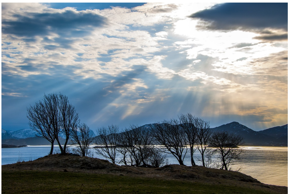
Tumulus, Ulstein, Møre og Romsdal

Norway hereby presents its candidacy for Guest of Honour at the Frankfurt Book Fair in 2019.