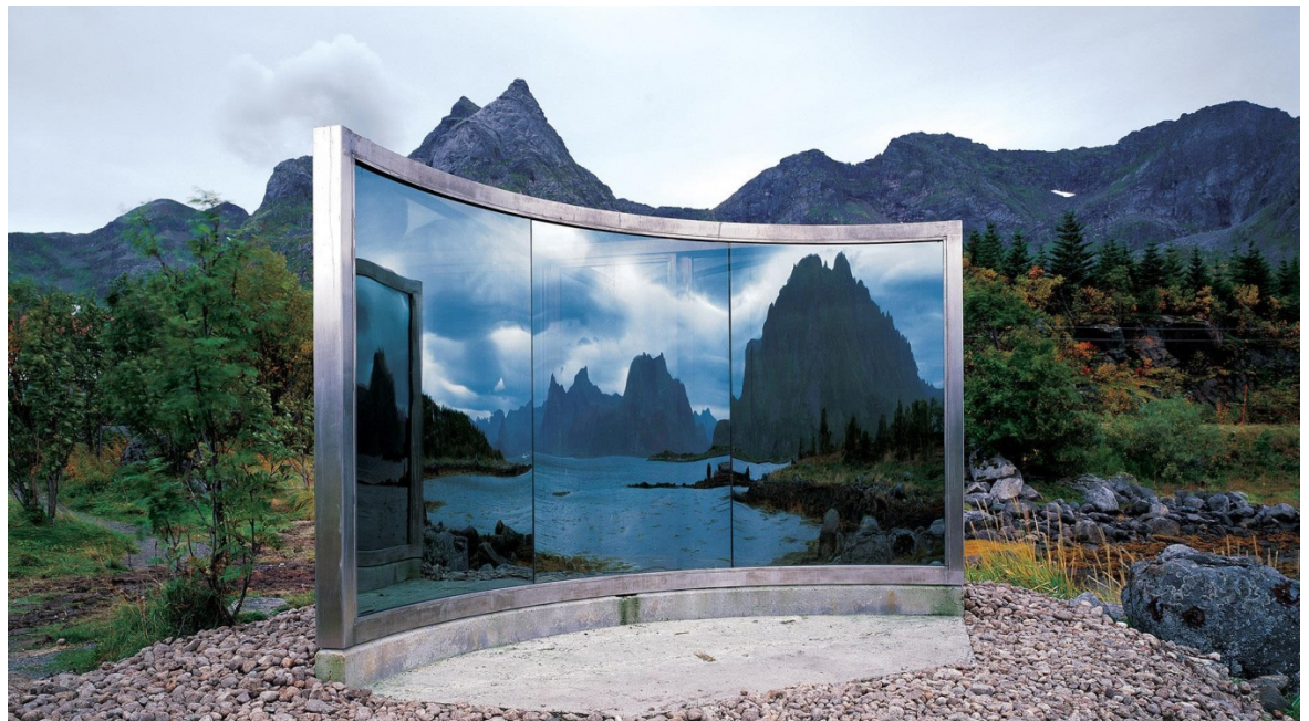
Dan Graham: Uten tittel, Vågan, Skulpturlandskap Nordland

Through a broad analysis we will devise a thematic programme of distinction and with a compelling appeal. This will predominantly entail the following themes: