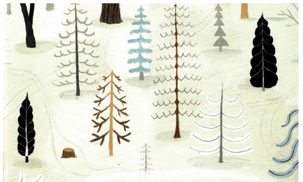
Bjørn Rune Lie: Slapsefjell (Slush Mountains)

NORLA has thus far collected donations amounting to NOK 13 million from private sources with connections to the book industry and foundations and aims at involving further foundations and trade and industry to raise the remaining funding in the course of 2016.