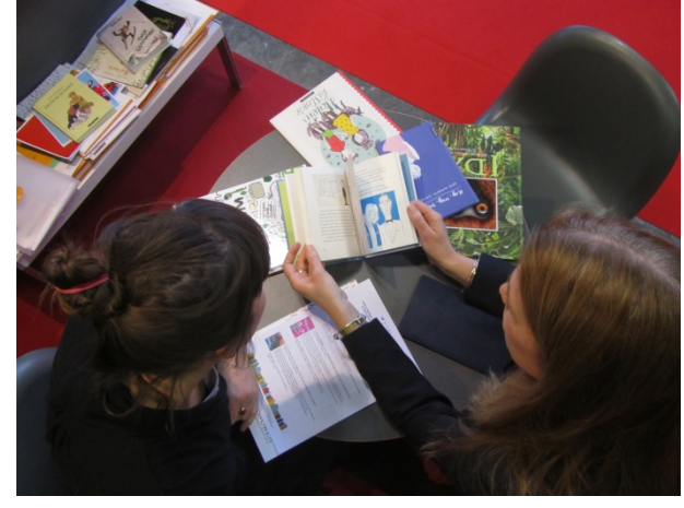
Norwegian children's books at a book fair

In the past few years translation into English has