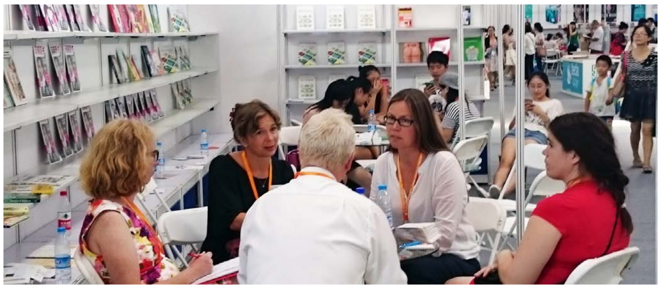
The Beijing International Book Fair

Publishers, critics and experts from the English language world will be invited to Norway in conjunction with Norway's Guest of Honour status. The same holds for a selection of journalists. Key persons of current interest will also be invited to programme events at the book fair in Frankfurt during the Guest of Honour year.