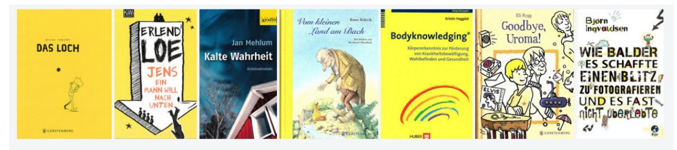
Norwegian books in German translation

The German translators are important ambassadors for Norwegian literature and specific events and initiatives will be dedicated to them, in Norway and Germany, as a part of the Guest of Honour project. The expertise of translators is an important resource and key individuals will be invited to contribute. Selected, large-scale translator projects dedicated to both fiction and classics will be established and made a priority. Two-way seminars that also involve translators from German into Norwegian are of interest, such as in collaboration with the Norwegian Association of Literary Translators.