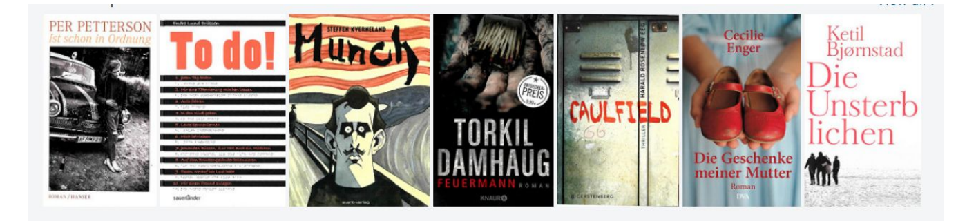
Norwegian books in German translation

The objective is to demonstrate contemporary Norwegian literature's rich variety and breadth as this influences and finds expression in the cultural and social life of Norway today. Literary quality, the willingness to experiment and a breadth of expression and themes are defining features of Norwegian fiction, non-fiction and literature for children and young people. The number of first-time authors remains high and the broad spectrum of authors holds the interest of the general public. We want to cultivate and develop this literary breadth and use the occasion to spotlight many new names for a new generation of German readers. A large number of authors from all genres will be invited to visit German venues during the years leading up to the culminating highlight of the Guest of Honour year.