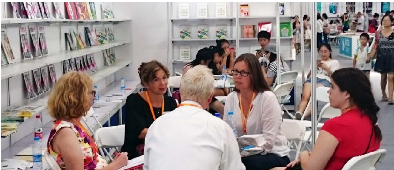
The Beijing International Book Fair

Publishers, critics and experts from the English language world will be invited to Norway in conjunction with Norway's Guest of Honour status. The same holds for a selection of journalists. Key persons of current interest will also be invited to programme events at the book fair in Frankfurt during the Guest of Honour year.