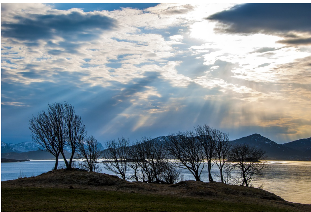
Tumulus, Ulstein, Møre og Romsdal

Norway hereby presents its candidacy for Guest of Honour at the Frankfurt Book Fair in 2019.