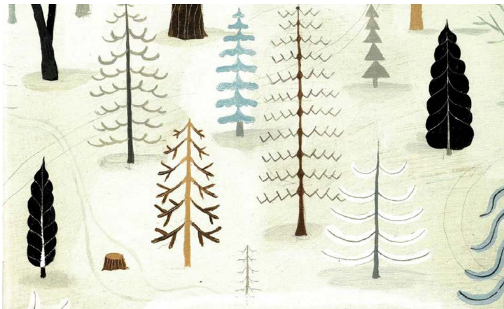
Bjørn Rune Lie: Slapsefjell (Slush Mountains)

NORLA has thus far collected donations amounting to NOK 13 million from private sources with connections to the book industry and foundations and aims at involving further foundations and trade and industry to raise the remaining funding in the course of 2016.