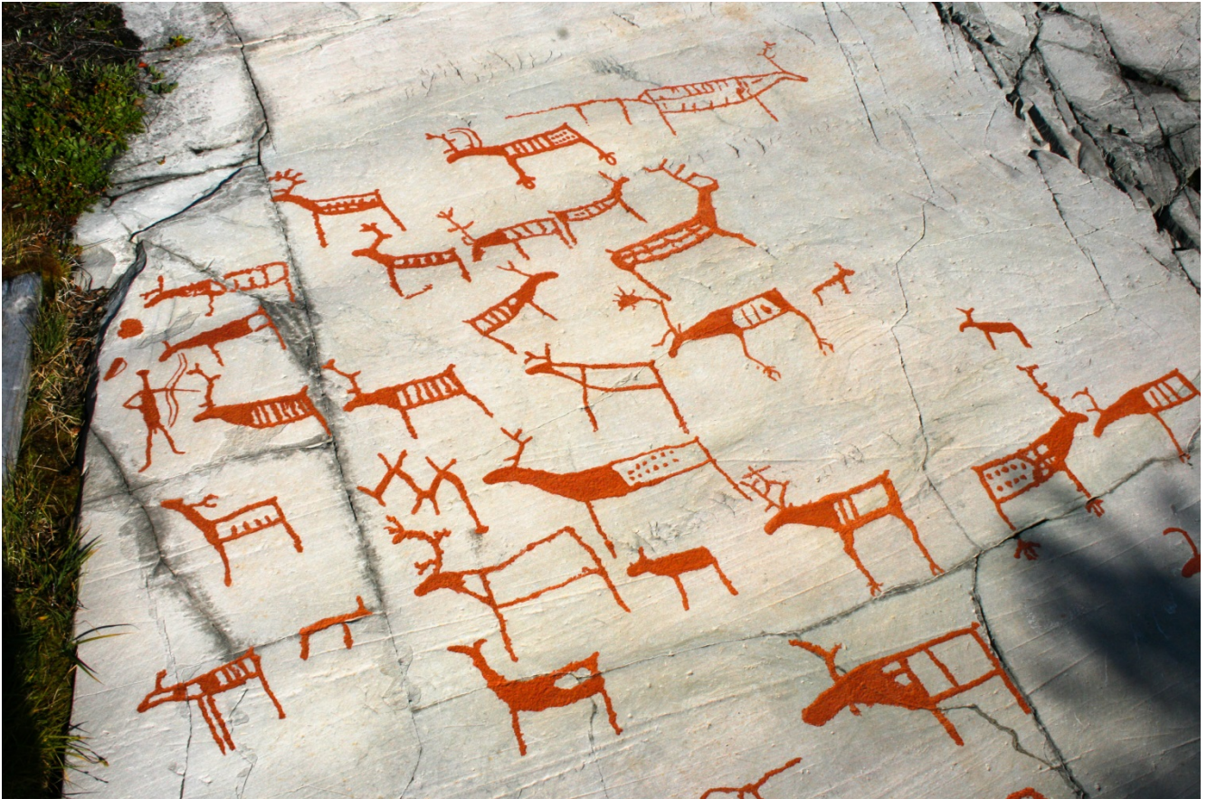
Rock carvings at Alta

The diverse and multicultural Norway is one of the important developments of our recent history. Ideals of mutual trust, equality, and proximity to decision-making have a strong position in Norwegian society and must be continually renewed to adapt to a more changeable world. Our consumption of nature is one of the great challenges of our times. We want to create a composite impression of Norway as a universe where modernity, nature, the environment and human beings challenge each other in mutual interaction.