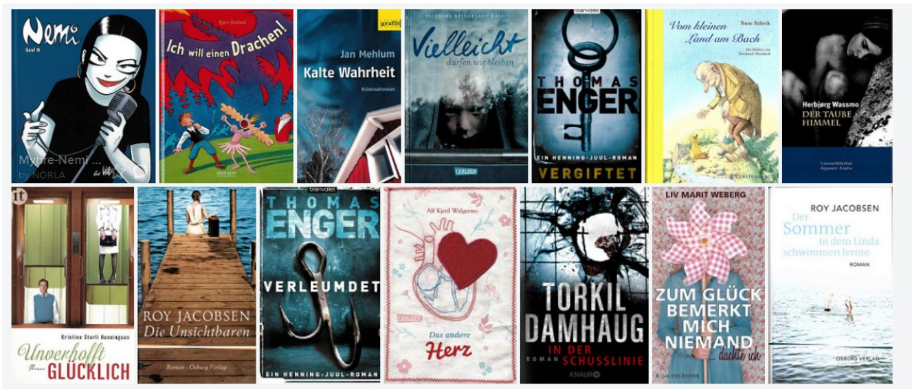
Norwegian books in German translation

the foundation is laid to enable more Norwegian authors to achieve international penetration. The good collaborative models that will be developed nationally will also hold the potential to produce positive results in the long term. We want to emphasize that Norwegian cultural export is to be elevated to a higher level and this is to be maintained above the current level also in 2020 and afterwards. This means that our goal is increased resources for a higher level of activity for Norwegian literature abroad in extension of the Guest of Honour project.