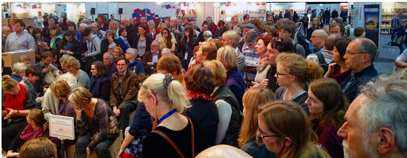
Audience at The Leipzig Book Fair 2015

NORLA aims to establish solid collaborative relationships within the framework of a main concept in 2016 and as soon as possible establish specific, individual projects to take place before, during and after the book fair in 2019, in Frankfurt, other German cities and Norway.