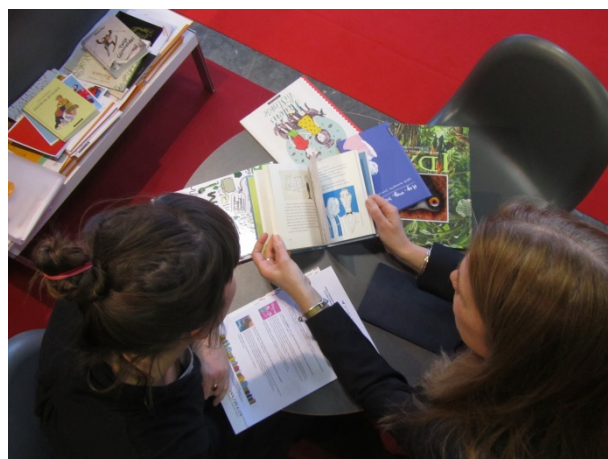
Norwegian children's books at a book fair

NORLA, the export body for Norwegian literature, has over the course of many years built up a large network of contacts in the German and international book industry and with translators, and administrates an extensive public policy system. Funding for translations has proven to yield good results in the publication of Norwegian literature in other languages. The translation funding is today at around EUR 600,000. Annually NORLA grants subsidies for more than 400 translations — into about 50 languages.