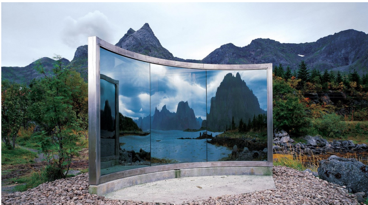
Dan Graham: Uten tittel, Vågan, Skulpturlandskap Nordland

Through a broad analysis we will devise a thematic programme of distinction and with a compelling appeal. This will predominantly entail the following themes: