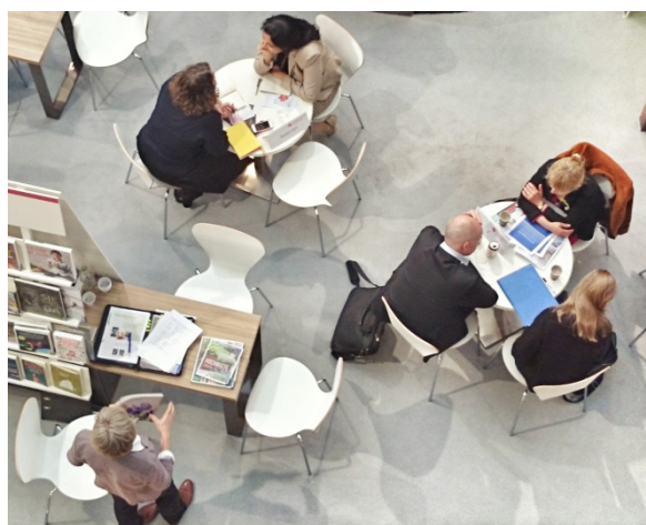
Meetings at a book fair

Norwegian authors, publishers and others from the literary world.