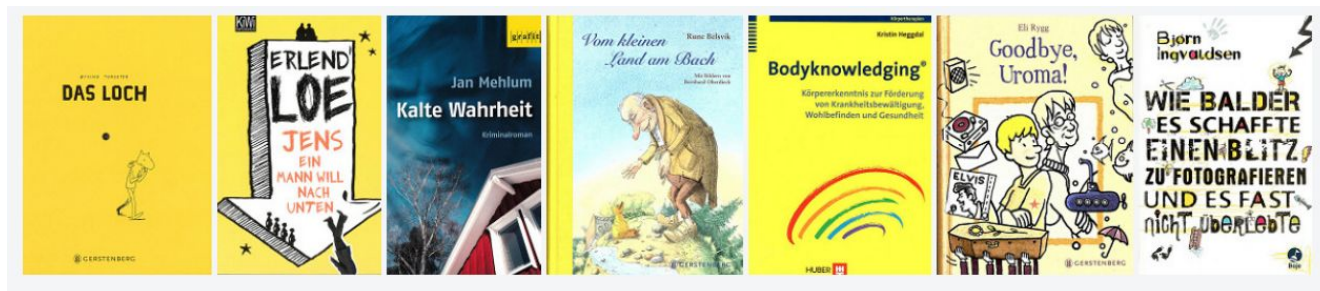
Norwegian books in German translation

The German translators are important ambassadors for Norwegian literature and specific events and initiatives will be dedicated to them, in Norway and Germany, as a part of the Guest of Honour project. The expertise of translators is an important resource and key individuals will be invited to contribute. Selected, large-scale translator projects dedicated to both fiction and classics will be established and made a priority. Two-way seminars that also involve translators from German into Norwegian are of interest, such as in collaboration with the Norwegian Association of Literary Translators.