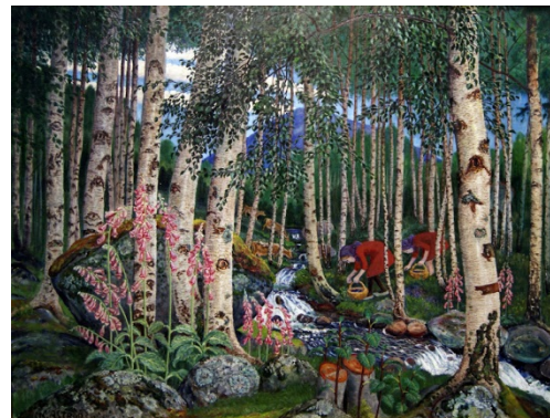
Nikolai Astrup: Revebjeller (Foxgloves)

Language is a topic well-suited for inspiring discussion, awakening emotions and fascination. The orthography of the Norwegian language encompasses a wealth of elective forms, in both bokmål and nynorsk . This says something about how individual linguistic choices and stylistic features are cultivated as an ideal, which can be challenging for translators, but produces abundant forms of creative expression. We wish to investigate, discuss and present language as a part of Norway's Guest of Honour presentation.