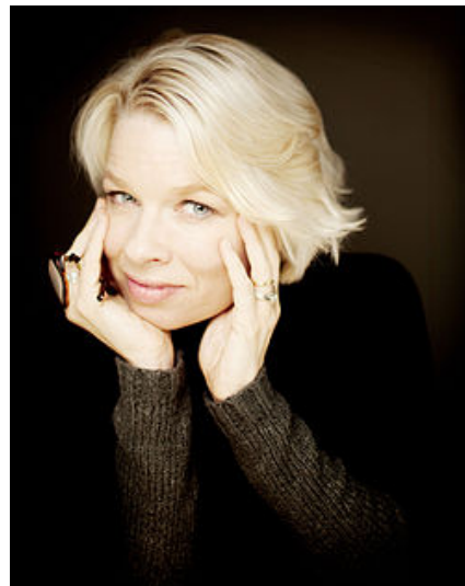
Linn Ullmann.

The Norwegian contribution to Nordic Noir is first and foremost represented by Jo Nesbø 's books on Harry Hole. Nesbø has been praised for having expanded the genre through his strong, literary qualities, his psychological insight and his depictions of life in a modern, globalized world. Other successful authors of the same genre are Gunnar Staalesen and Anne Holt , among many others. Norwegian crime fiction literature often focuses on social and political issues, and like the fiction it is derived from, the result is of an essentially high literary quality. The queen of crime fiction, Karin Fossun , also writes novels, short stories and poetry. Norwegian poetry is alive and thriving, but often finds its way to the world through different channels — a large number of poets are invited to festivals and are often translated in select magazines, journals and smaller publications.